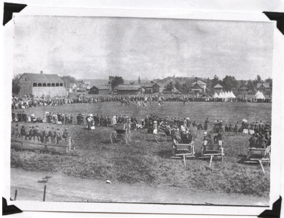
FALL FAIRGROUNDS, JUBILEE PARK, BRACEBRIDGE 1916 showing grandstand & Womens Institute building

A glimpse into the past provides a great deal of insight into the present. The OAAS will be turning 175 next year! Glancing at our history emphasizes the reality of the transformative change that has taken place for the Provincial body of the Agricultural Societies in Ontario and what is yet to come.